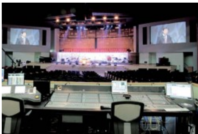
Onstage monitors are mixed directly from an Avid Venue FOH console

level of design, build and technical fitting. 'SinKwang is modelled very clearly on the mega churches of the US,' he reasons. 'Especially in terms of