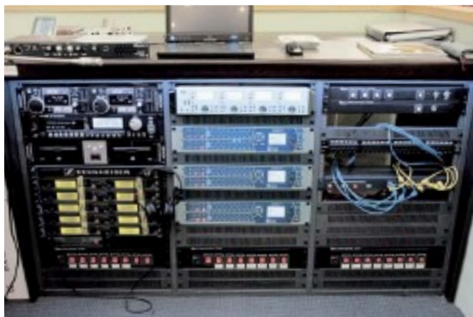
System drive and processing is handled by a Galileo loudspeaker