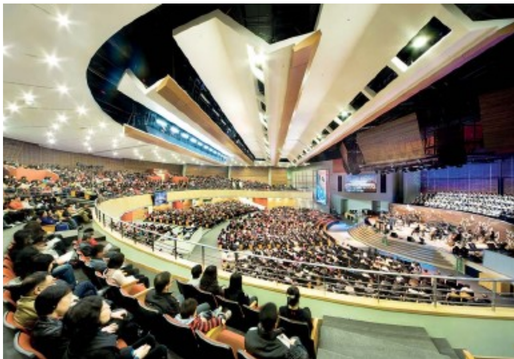
SinKwang main worship center from the balcony

A versatile performance space draws upon venerated Western brands for a sophisticated sound as Phil Ward discovers