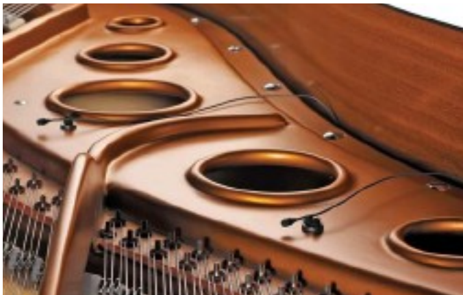
DPA SMK4061 microphones installed in a piano

www.meyersound.com www.dpamicrophones.com www.acousticdimensions.com