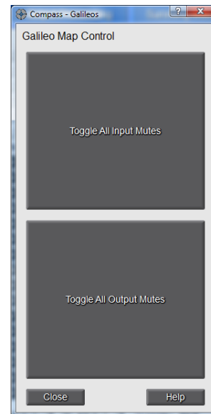
Figure 3. Modified Galileo Map Control Window