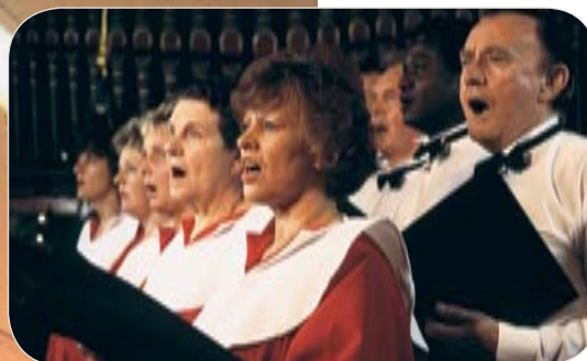
For choral singing, Constellation supplies clarity, warmth, and body.