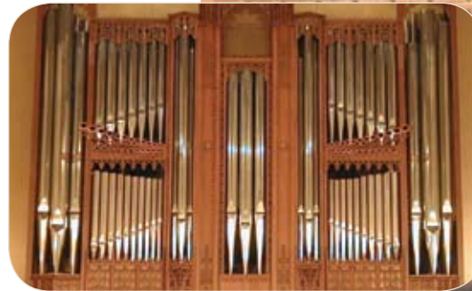
Constellation offers rich, natural acoustics appropriate for any genre of music.