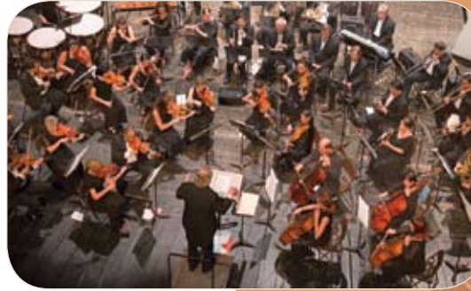
Constellation Ensemble™ provides performers with an electronic orchestra shell.

Constellation electroacoustic architecture is a system that combines the natural acoustics of a space with powerful technology to create acoustics with natural characteristics, the aural qualities of the world's best rooms, and broad flexibility. Created by experts in acoustics, classical music, and digital processing technology, this system was developed to give venues the ability to supply appropriate acoustics for each kind of performance they host, all accessible with a single button press.