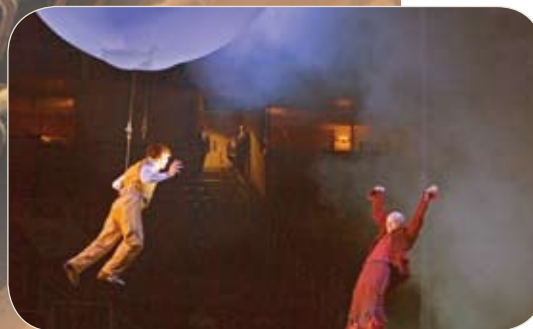
Constellation Experience Settings enable sound designers to take audiences through fanciful environments.

“ Constellation is, to my ears, living proof that skilled engineering and technology can indeed improve the physical spaces where we listen to music. ”