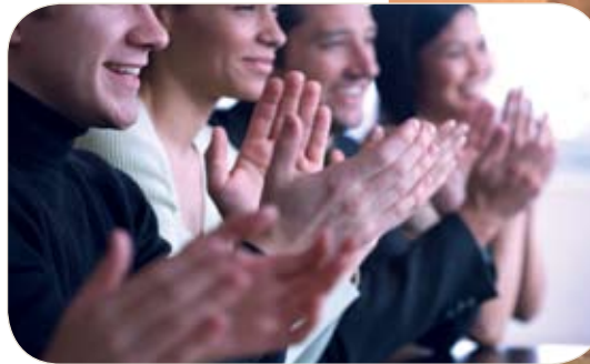
Audiences are more engaged when they feel immersed in the sound of the crowd.